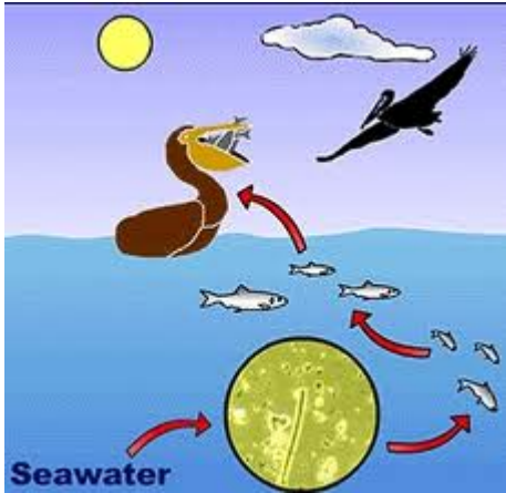
Biomagnification of DDT