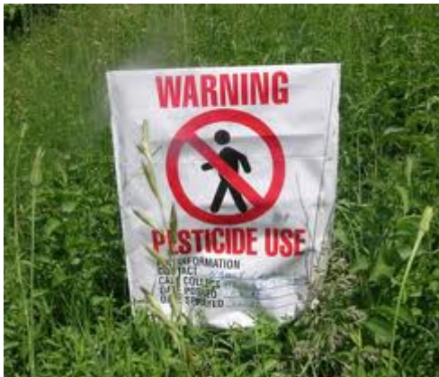
Sign board kept in the pesticide use field

Want to know more details about the advantages and disadvantages of Pesticides? Click here to schedule a live help with an eTutor!