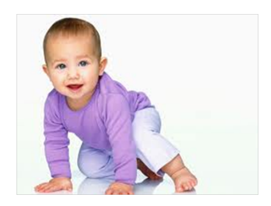
Things To Keep In Mind

You are the customer relations executive at Grand Sheraton and a guest comes in with his young son and elderly parents. Kids are cute and adorable but they do create a lot of commotion. On the other hand, when you have elderly guests, there are certain special requirements that you need to fulfill. With your fluent English speaking skills, you can manage and service the customers such that they do not face any inconvenience. Keep the below things in mind before proceeding.