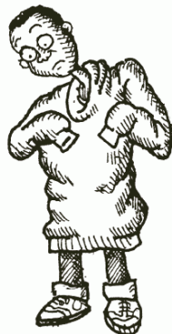
Kevin's sweater is too big

Let us today clear the confusion on when to use 'too' and when to use 'enough'. You might use them interchangeably; however, there is a whole lot of difference in their meanings. Even the expert English speakers get confused between the usages of the two. Therefore, don't worry and try to understand the meaning with the help of the following explanations and the examples mentioned.