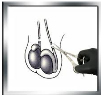
Two kinds of IUDs