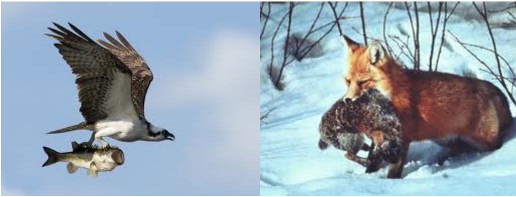
Predator - Prey