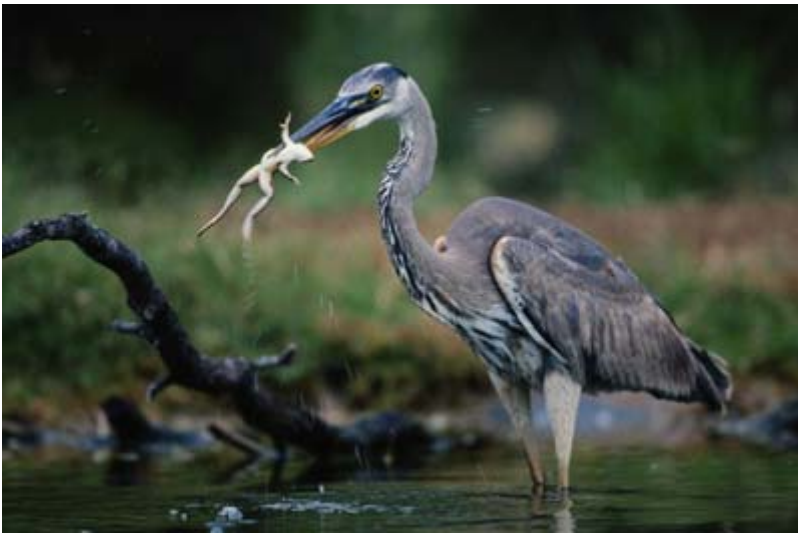
A great blue heron eating a frog

The insect population is partially controlled by frogs. Frogs, though, are good prey for many animals. So to escape from its enemies, frogs use lots of survival tools. Staying stable and showing like a dead animal and running away are the common adaptations. Different varieties use different adaptations. The four-eyed frog, Physalaemus nattereri , has two spots that look like eyes near its back legs. It shows these spots to predators, making it look like a more threatening animal.