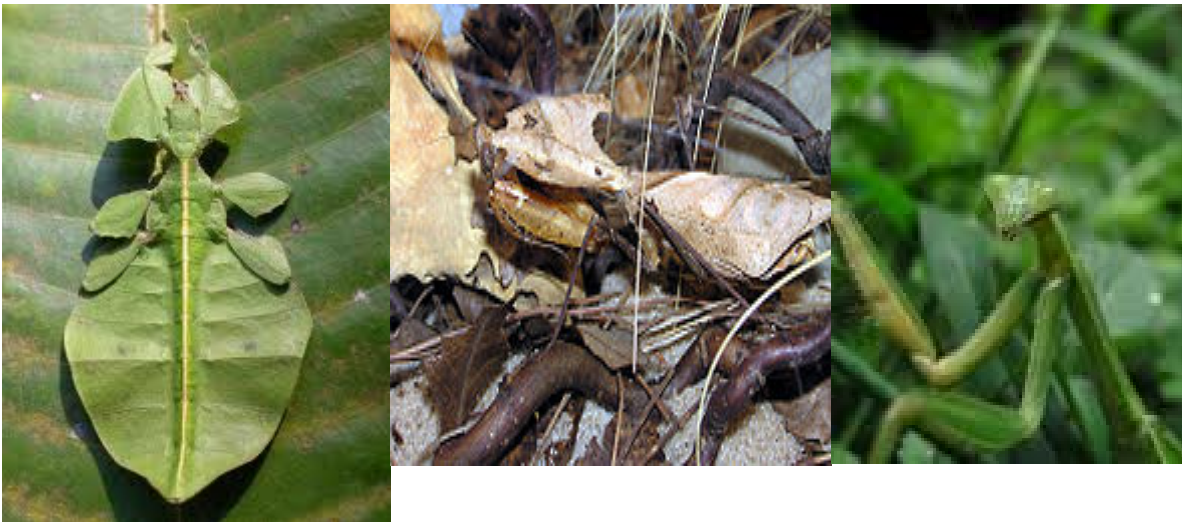
Camouflage of the dead leaf mantis makes it less visible to both its predators and prey.

Camouflage is one adaptation used by both predators and prey. Some creatures not only have special coloration and patterning but can actually change colors, such as a chameleon. So both the predators and prey can't detect it because of its appearance which helps it blend into the background.