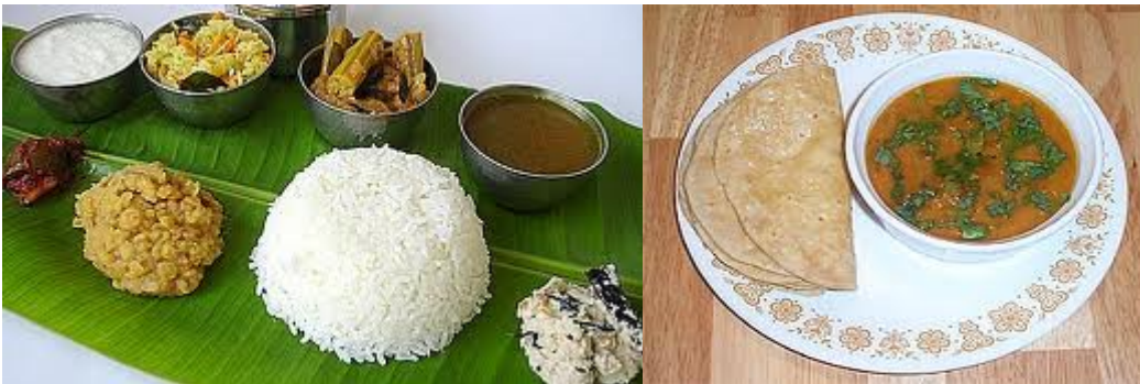
Rice and Vegetables & Roti and Dal

Humans depend on the same type of food. If for any such reason suddenly the rice and corn or maize and wheat crops failed to grow ... just imagine what happens? The whole world would be hard pressed to feed all. If we have a choice of anything good can be eaten, we won't have any problem.