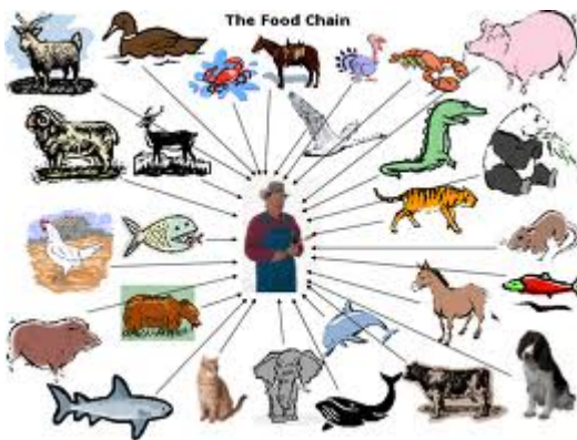
Human Relationship with Ecosystem

A simple ecosystem is created by us with agriculture. This food chain has only three levels - producers (crops), primary consumers (livestock, humans) and secondary consumers (humans). Since very few trophic levels in the food chain the loss of energy is also very less. This is beneficiary for humans.