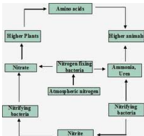
The Major stages of Nitrogen cycle